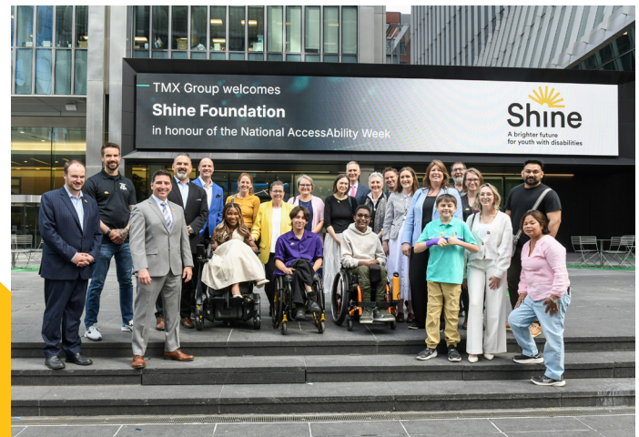
Shine Board members, staff, Dreamers, and guests were invited to join us on National AccessAbility Week to ring the bell, opening the Toronto Stock Exchange.